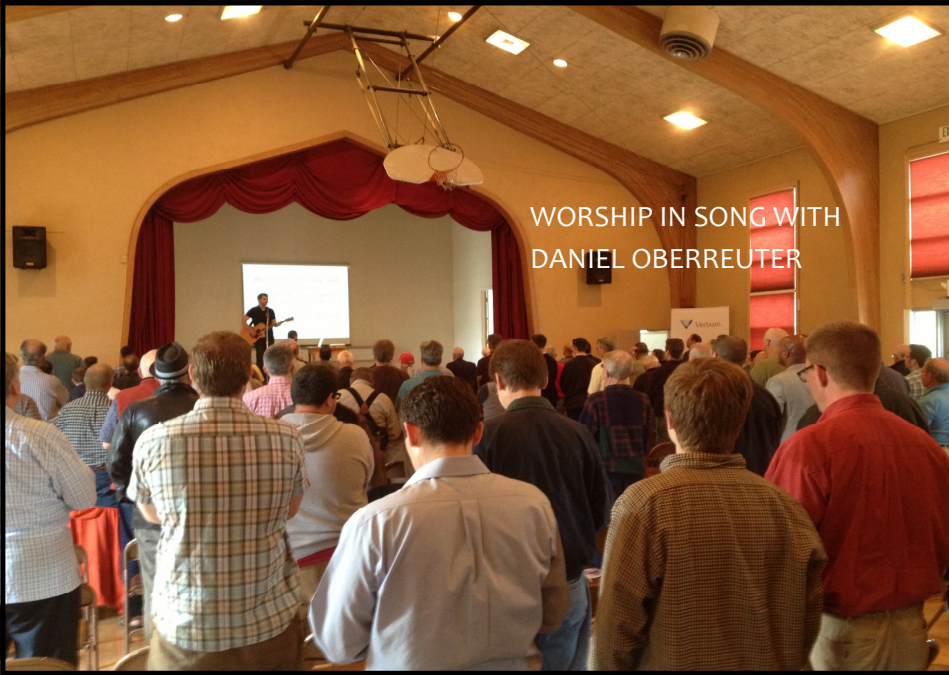
WORSHIP IN SONG WITH DANIEL OBERREUTER