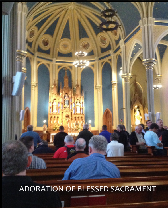
ADORATION OF BLESSED SACRAMENT