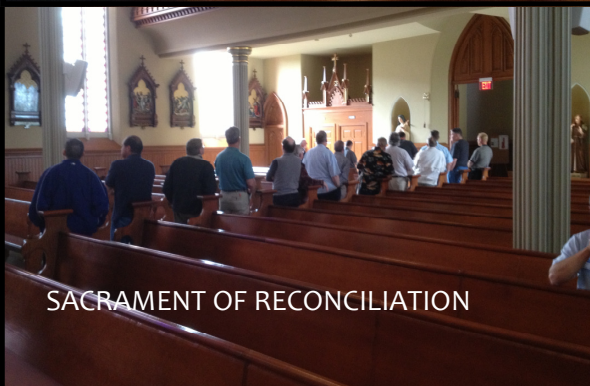
SACRAMENT OF RECONCILIATION