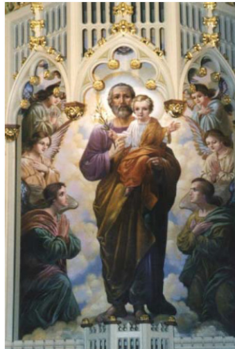
St. Joseph ...Pray For Us.

We entrust the Fatherhood Fraternity to the patronage of St. Joseph.