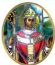
St. Mel's Catholic Church

By the savage blood of Jesus, gain your strength to be the man God called you to be from all eternity.