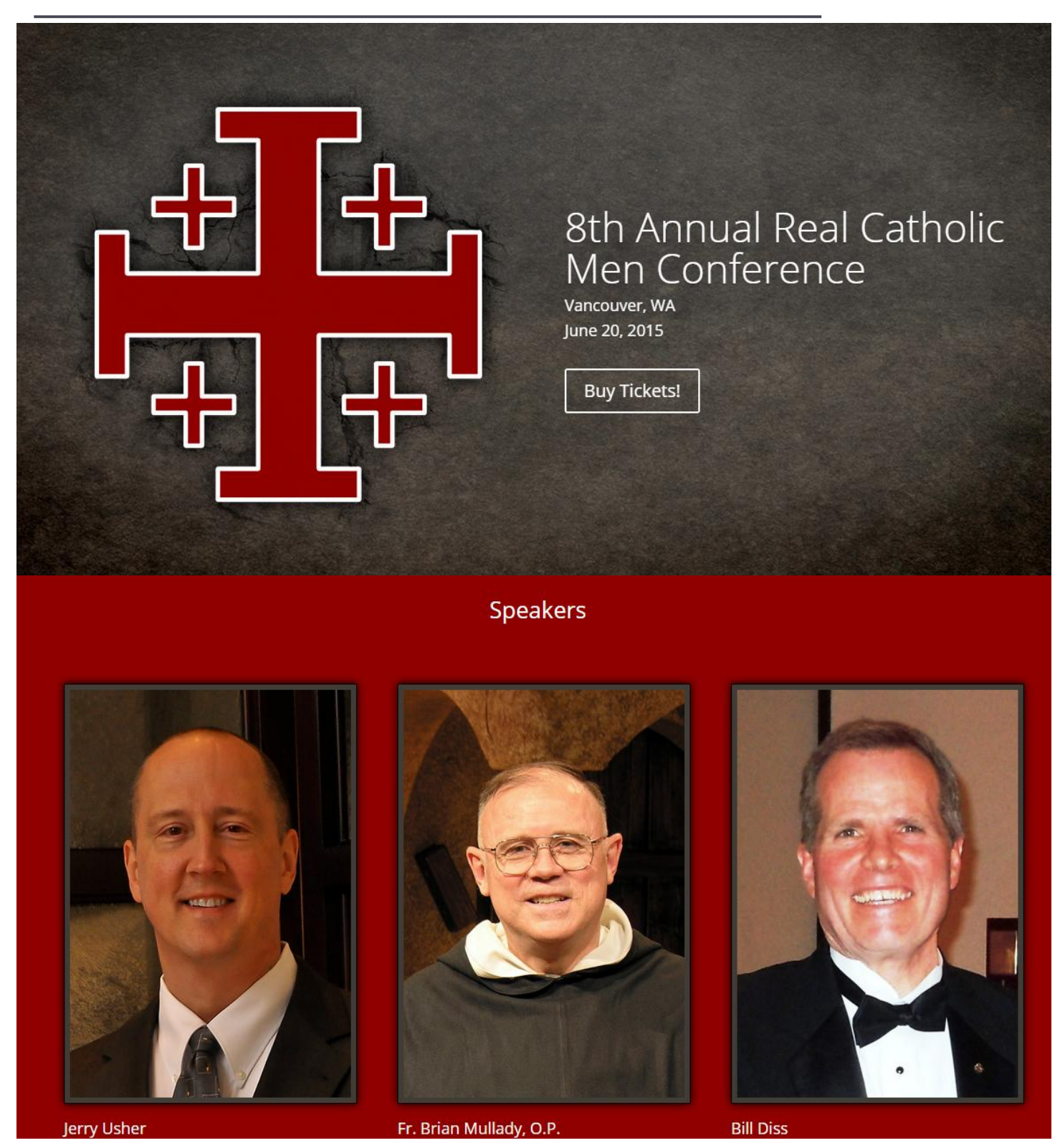
Get your tickets now and save $5 at http://www.realcatholicministries.com