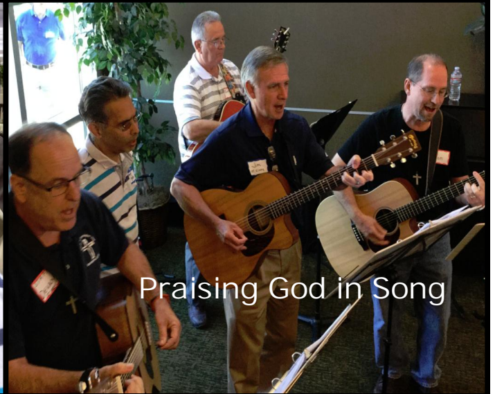
Praising God in Song