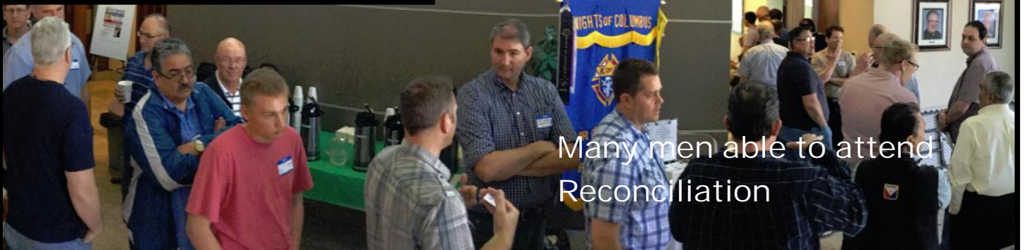
Many men able to attend Reconciliation