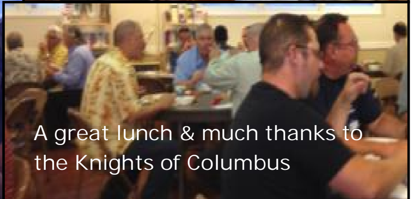
A great lunch & much thanks to the Knights of Columbus